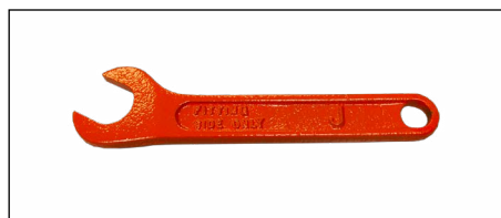
Model J Wrench