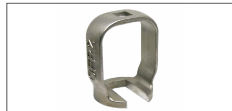
Model GFR2 Wrench