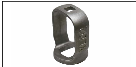
Model XLO2 Wrench