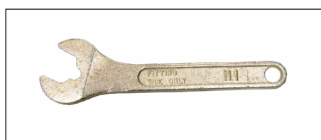
Model N1 Wrench