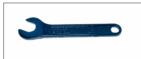
Model H Wrench