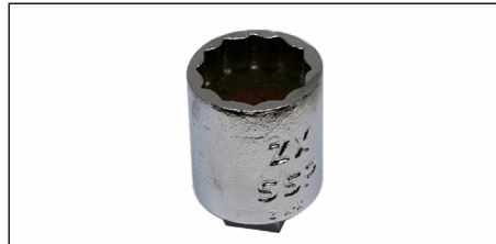
Model ZX Wrench