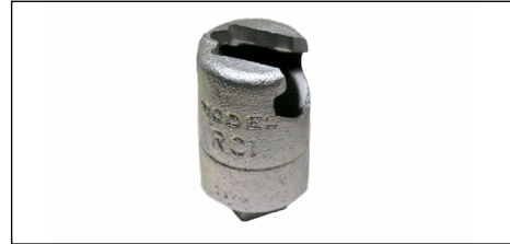
Model RC1 Wrench