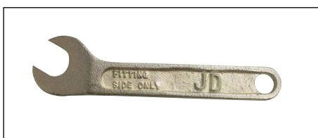
Model JD Wrench