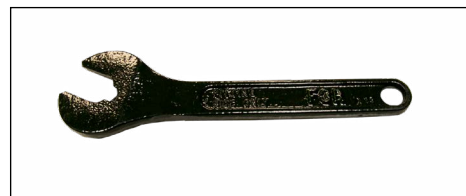
Model F3R Wrench