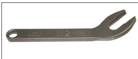
Model W2 Wrench