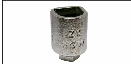
Model ZX-HSW Wrench