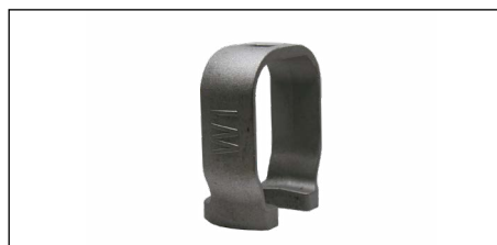
Model W1 Wrench