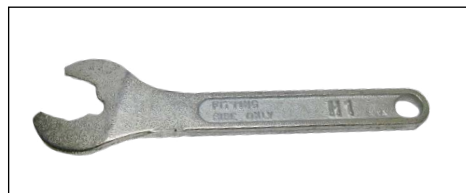
Model H1 Wrench