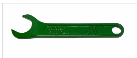
Model JV Wrench