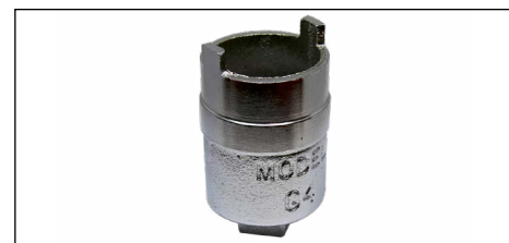
Model G4 Wrench