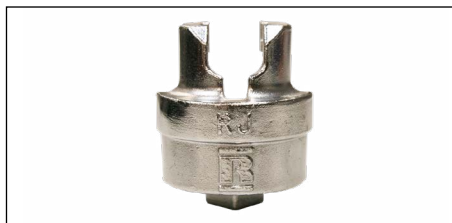
Model RJ Wrench