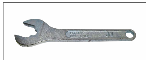
Model J1 Wrench