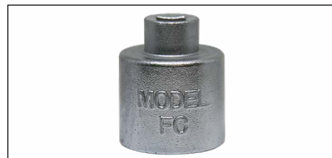
Model FC Wrench