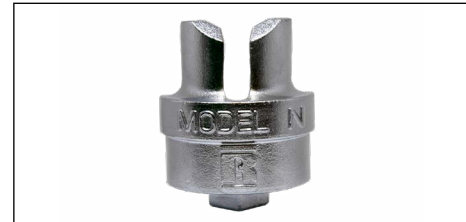
Model N Wrench