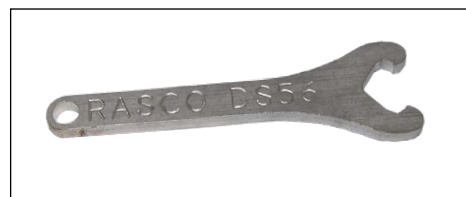
Model DS56 Wrench