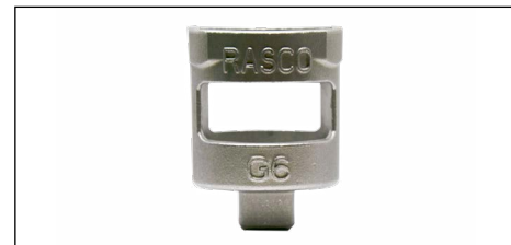
Model G6 Wrench