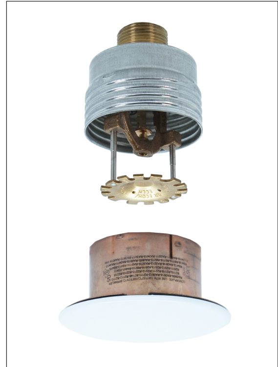
G4XLO QREC ECLH/ECOH Concealed

Model G4XLO QREC sprinklers are extended coverage quick-response concealed pendent fire sprinklers intended for use in accordance with NFPA 13 as well as the requirements of any other authority having jurisdiction. Minimum flow and pressure requirements, based upon sprinkler spacing, are provided in Table B (page 2).